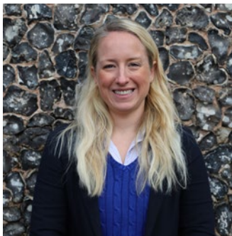
Head of Middle School