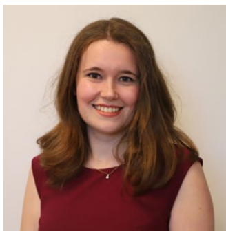
Head of Shell