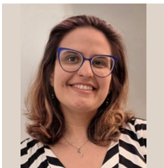
Head of Remove