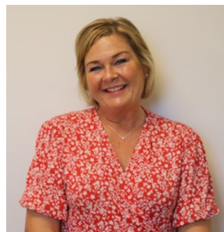
Head of Years 5 and 6