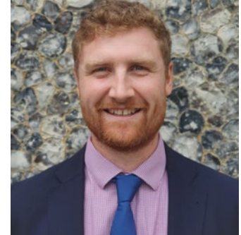
Deputy Head Co-Curricular