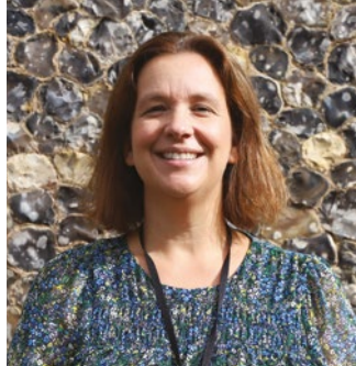
Deputy Head Pastoral