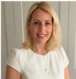
Head of Junior Prep