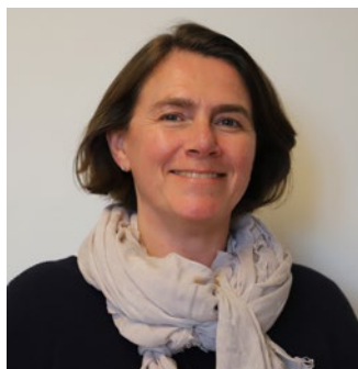
Head of Years 3 and 4