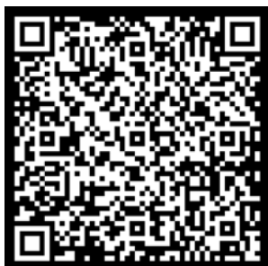
Years 7 and 8 Pre-Season Sport sign up form