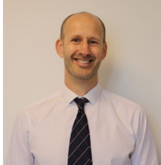
Head of Sixth Form