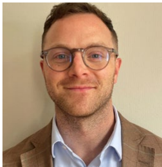
Head of Lower Sixth