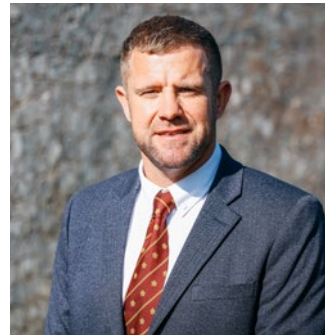
Head of Year 8