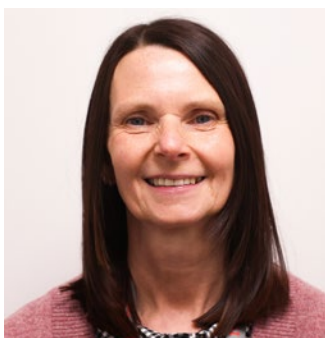
Head of EYFS