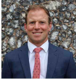
Head of Senior Prep