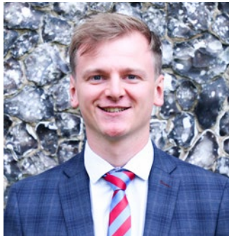
Head of Year 7