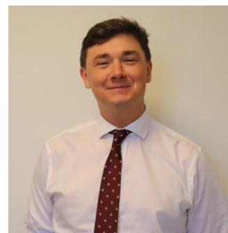
Head of Fifth Form