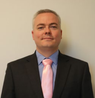
Deputy Head Academic