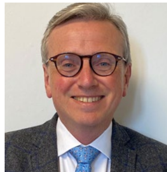
Head of Upper Sixth